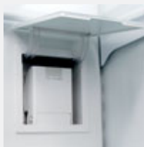
Air Purification System