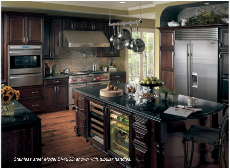
Stainless steel Model BI-42SD shown with tubular handles.

Model BI-42SD offers convenient side-by-side refrigeration along with an ice and water dispenser through the refrigerator door. Sub-Zero dual refrigeration along with new air purification and water filtration systems guard the freshness of your food and water like nothing before. Framed, overlay/flush inset and stainless steel models are available. New flush inset installation allows the unit to sit flush with surrounding cabinetry.