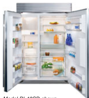
Model BI-48SD shown.