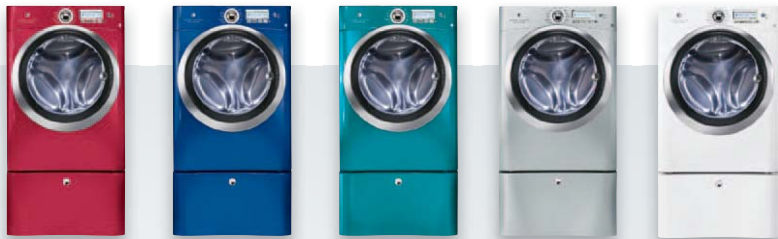
Red Hot Red (RR) Mediterranean Blue (MB) Turquoise Sky (TS) Silver Sands (SS) Island White (IW)